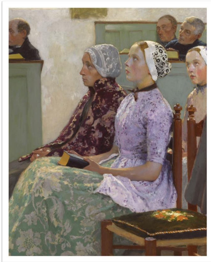
Sunday Mass, (ca. 1895) by Gari Melchers

The best advice is given towards the end of the New Testament, in the second chapter of James' letter. It doesn't matter what you wear – just don't try to show off, and don't be impressed by others who do. "If a person with gold rings and in fine clothes comes into your assembly, and if a poor person in dirty clothes also comes in, and if you take notice of the one wearing the fine clothes and say, 'Have a seat here in a good place, please,' while to the one who is poor you say, 'Stand there,' or, 'Sit by my footstool,' have you not made distinctions among yourselves and become judges with evil thoughts? ... Has not God chosen the poor in the world to be rich in faith and to be heirs of the kingdom that he has promised to those who love him?" God takes us as we are. So should we.