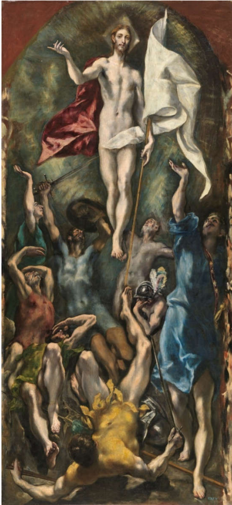
The Resurrection, El Greco, 1597-1600, Museo Nacional del Prado, Madrid