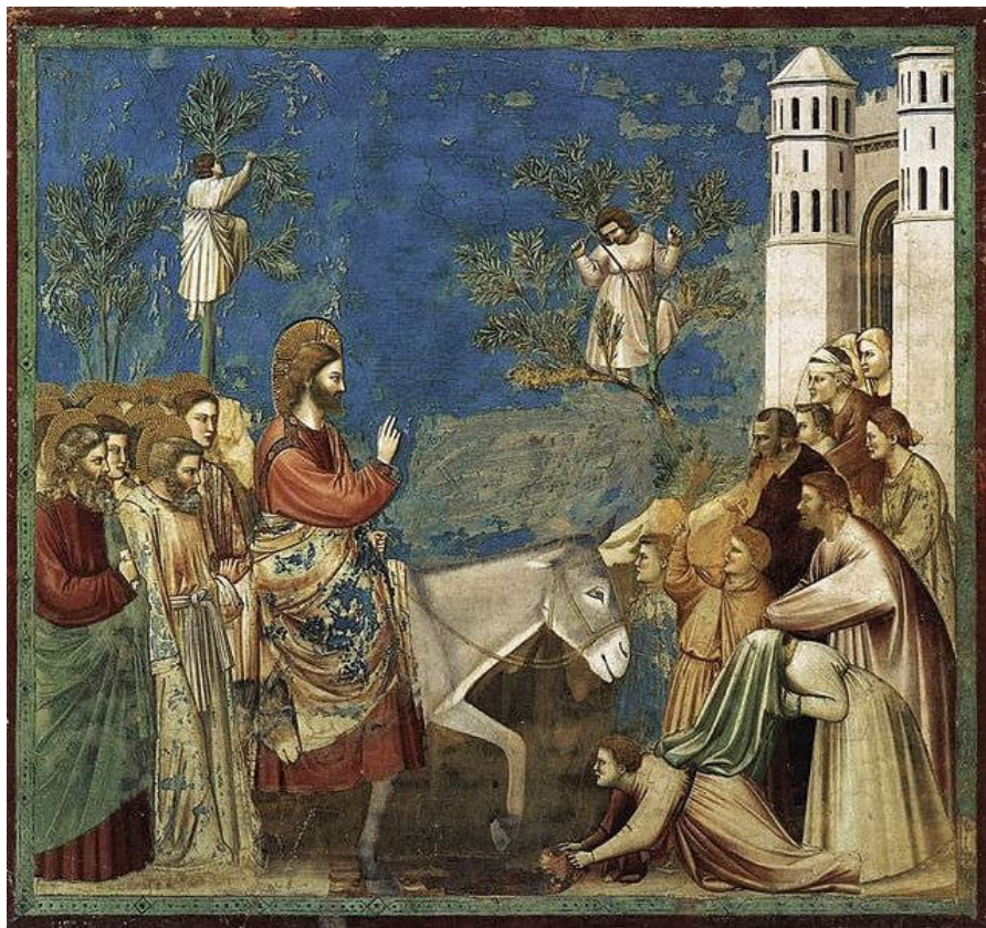
The Entry into Jerusalem, Giotto, c. 1305, Scrovegni (Arena) Chapel, Padua, Italy